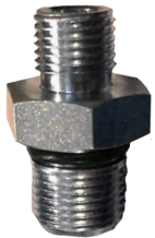
3. SG 3/4 Fitting—pipe to buttonhead Item # 12525